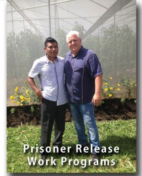
Prisoner Release Work Programs