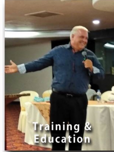
Training & Education