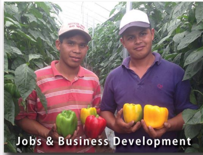
Jobs & Business Development