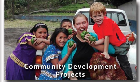
Community Development Projects