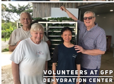
VOLUNTEERS AT GFP DEHYDRATION CENTER