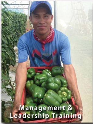
Management & Leadership Training