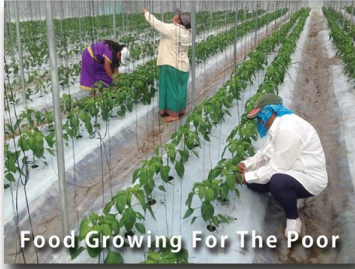
Food Growing For The Poor