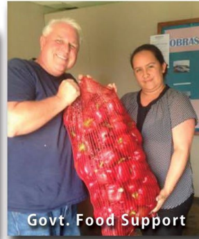
Govt. Food Support