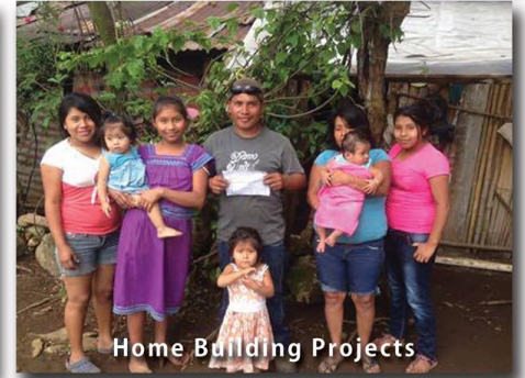
Home Building Projects