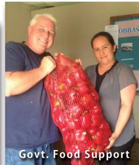
Govt. Food Support