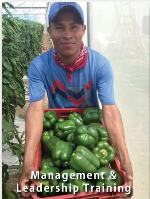
Management & Leadership Training