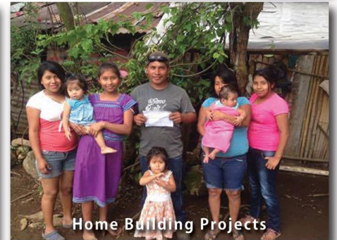
Home Building Projects