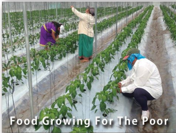
Food Growing For The Poor