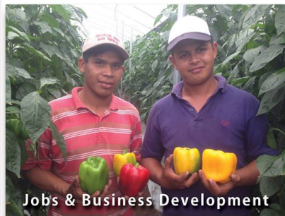
Jobs & Business Development